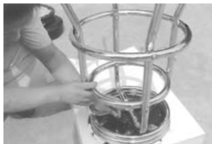
Step 5: Turn the barstool over and bolt the seat base to the pad as shown in the image above.