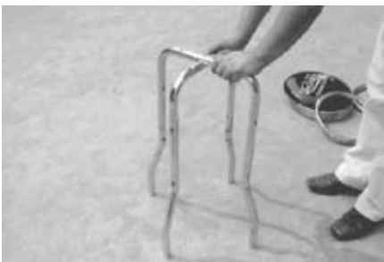
Step 1: Place the two legs together as shown in the image above.