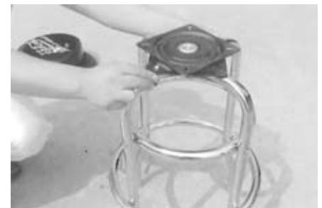
Step 3: Place the swivel plate on top of legs and align holes. Insert bolts and screw on nut securely.