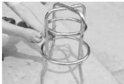
Step 2: Slide the larger ring over the legs and align the holes. Slide the sleeved, allen head screw into the hole and an allen head screw through the other side and tighten down using the supplied allen wrenches. Repeat for the other holes. Slide the support ring inside the legs and repeat the steps for attaching the larger ring.