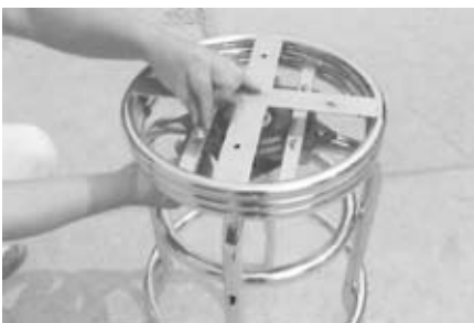
Step 4: Place the seat base on top of the swivel plate. Align the holes and insert the bolts. Screw on nuts securely.